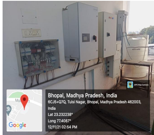
Wheeling Of Grid